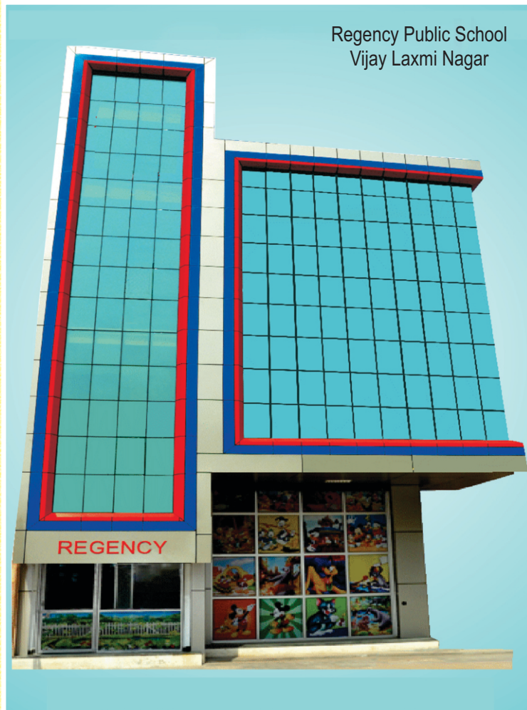
Regency Public School Vijay Laxmi Nagar