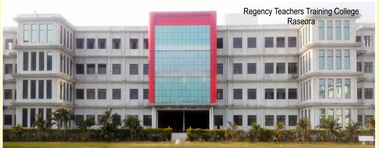
Regency Teachers Training College Raseora