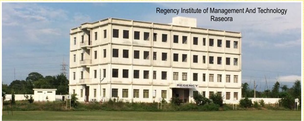
Regency Institute of Management And Technology Raseora