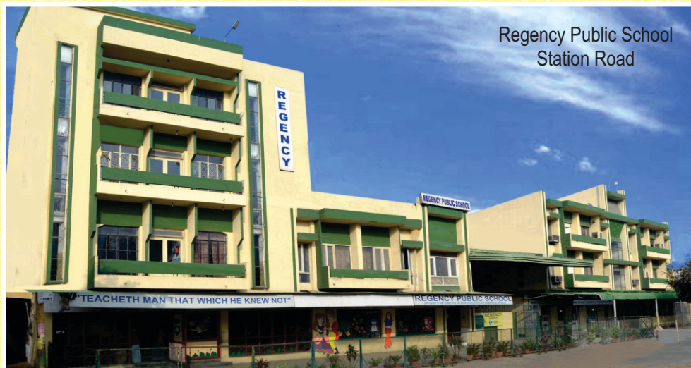
Regency Public School Station Road