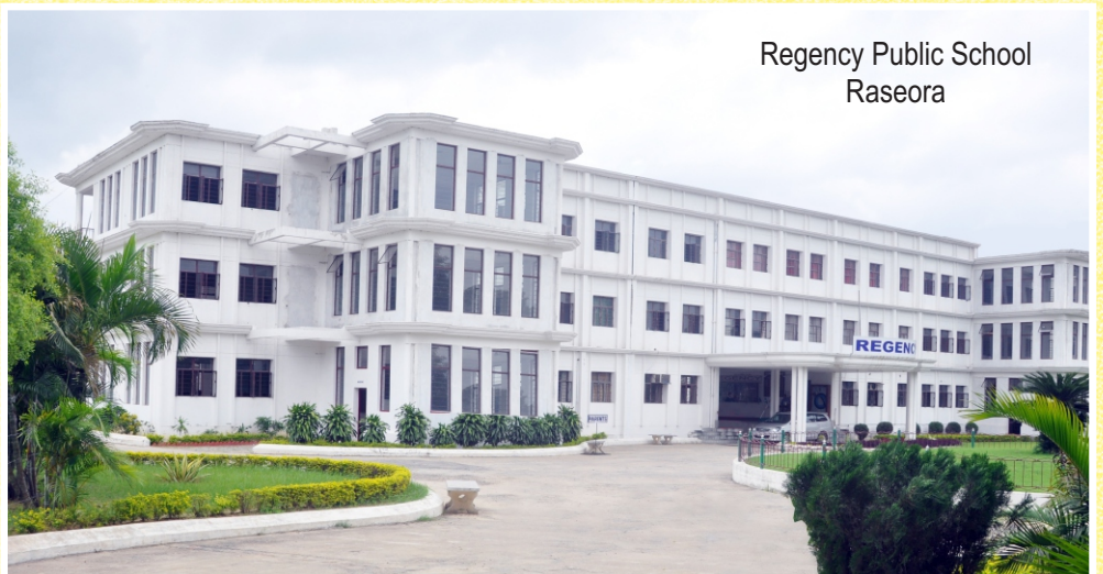
Regency Public School Raseora